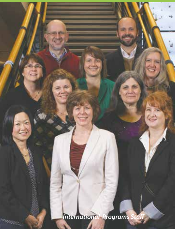
International Programs Staff